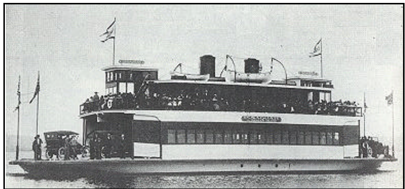
Maiden Voyage, May 2, 1914. Reproduced in This Was Issaquah, page 18.

You can read more about the Issaquah Ferry online at www.IssaquahHistory.org ; look under "Historic Sites Buildings and Sites."