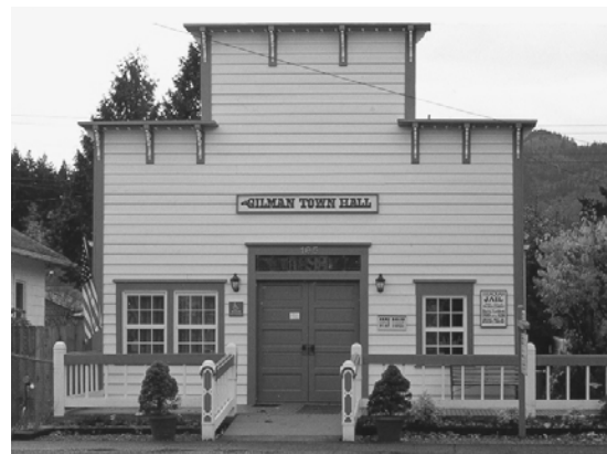
Gilman Town Hall Museum, 165 SE Andrews St.