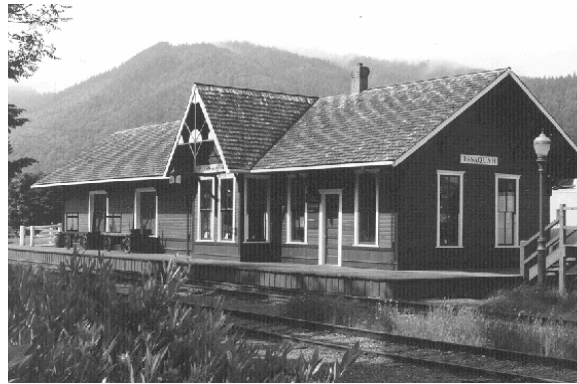
Issaquah Depot Museum, 50 Rainier Blvd. N

Memorial gifts and other donations to the endowment fund help us to build a source of sustained support, ensuring our continued service to the Issaquah community in the decades to come.